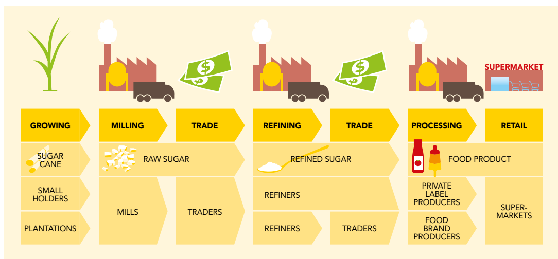
Figure 1: Different phases, product transformations, company types and major global corporate actors in the sugar cane supply chain

the most important company group of sugar users. The largest supermarkets globally include Walmart, Costco, Carrefour, Tesco, Lidl and Aldi. 24